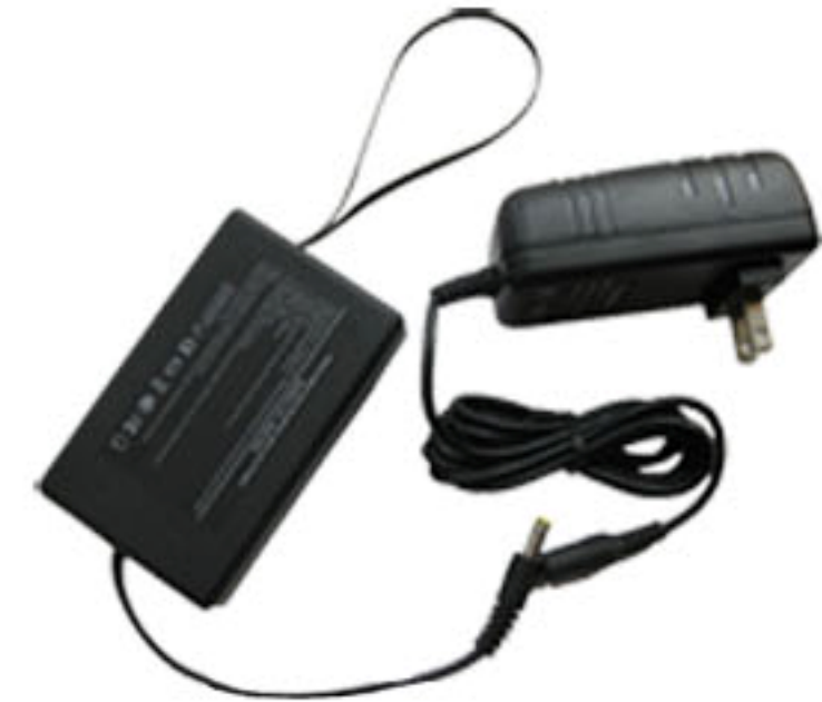
Mobile Rechargeable Battery