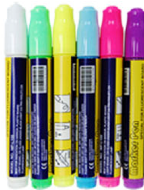
Fluorescent Marker Pen